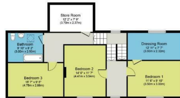
First Floor Approximate Floor Area 978 sq. ft. (90.8 sq. m.)