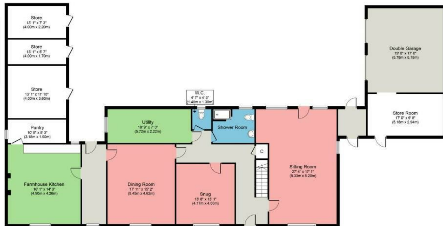
Ground Floor Approximate Floor Area 2,681 sq. ft. (249.1 sq. m.)